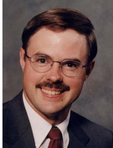
Chris Nelson Secretary of State

The Security Act of 1985, which was passed by the United States Congress, gave the states an option to choose either of two plans to notify purchasers of farm products of an existing security interest: a central filing system or prenotification. The 1987 South Dakota Legislature passed a law to allow implementation of a central filing system. If farm products are filed only under the UCC and not as an EFS, they are not reported on the central filing list which is distributed to buyers of farm products. The EFS portion must be completed to be included on the notification list.